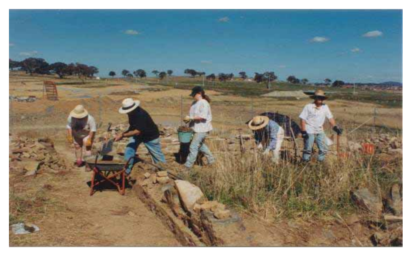
Crinigan's Hut site being cleared of rubble and brown snakes.

The Canberra Archaeological Society and Crinigan family descendants (pictured below) excavated the cottage site and are still analysing the artefacts recovered.