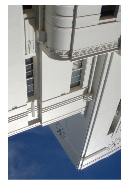
SOME EXAMPLES TYPICAL ART DECO FEATURES

walk. Read them from the top of the photo down: from the list inside) to help you identify them as you This image illustrates a number of key Art Deco features