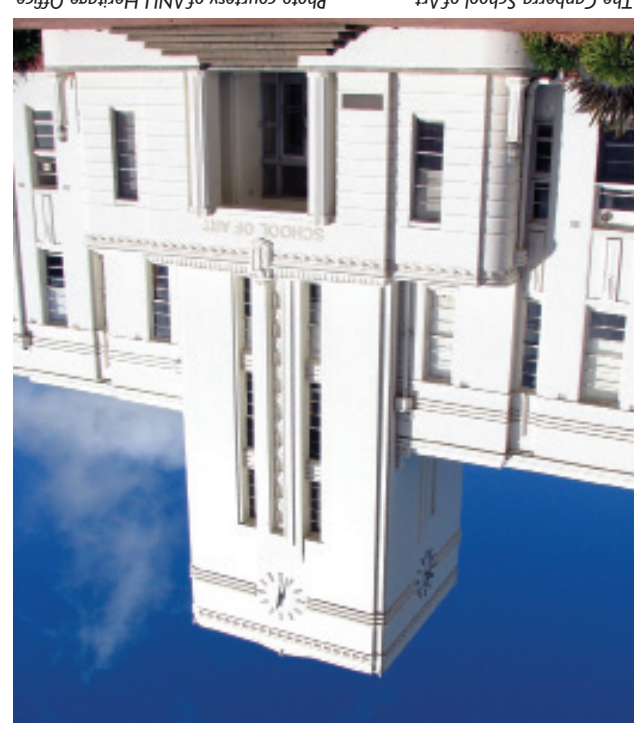
A SELF-GUIDED WALKING TOUR ART DECO IN ACTON